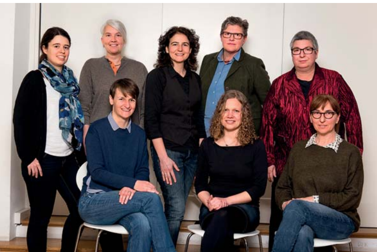
The team of the Counselling Centre LeTRa

For a list of our current activities, please check our website www.letra.de